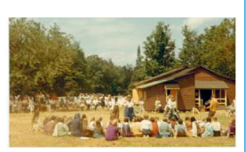
Camp Neringa was opened in Vermont for Lithuanian children, youth, and families, replacing the girls' cam on Convent grounds. Girls came from all over the country to enjoy this