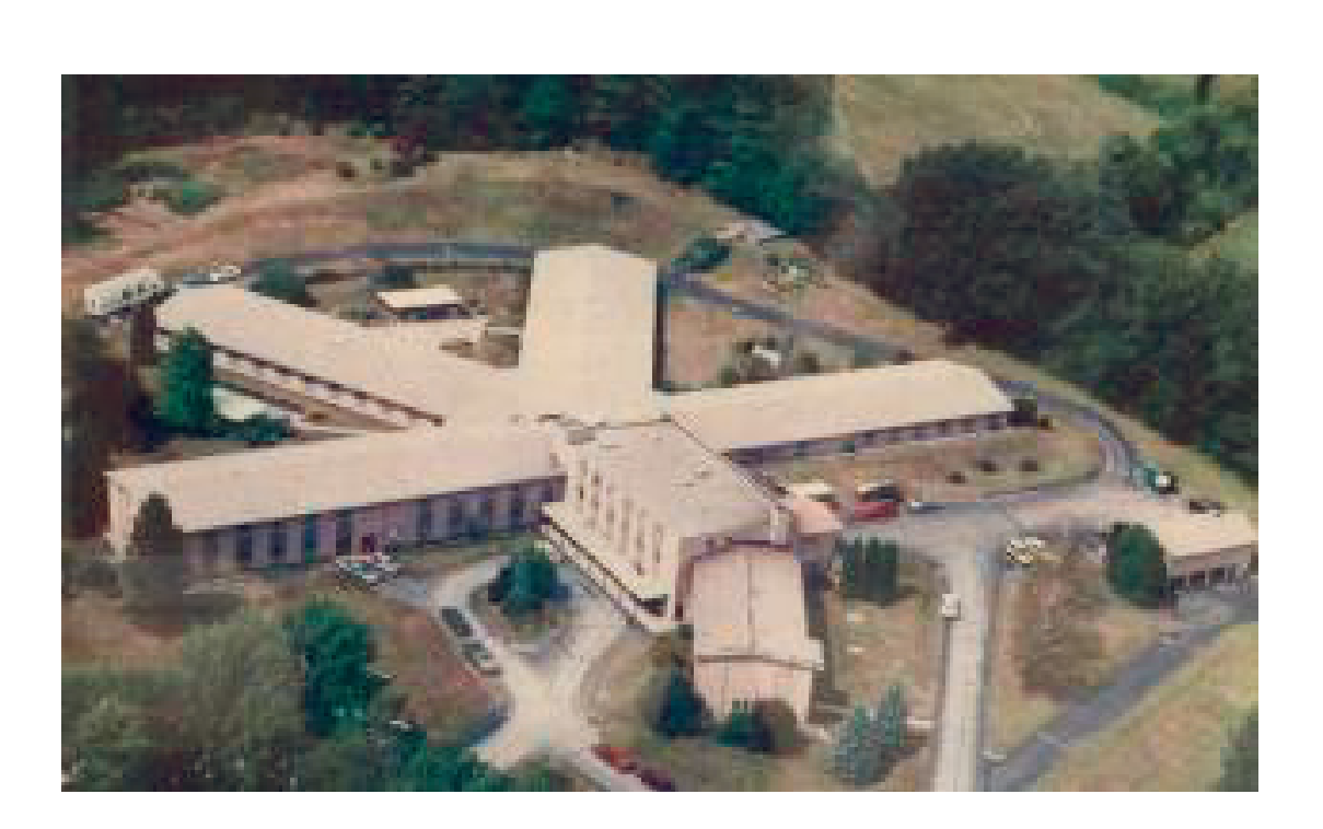
Matulaitis Nursing Home became a reality through the financial support of thuanians throughout the United States. They also received a US federal grant. The 90 bed health care facilit was opened on June 14th.