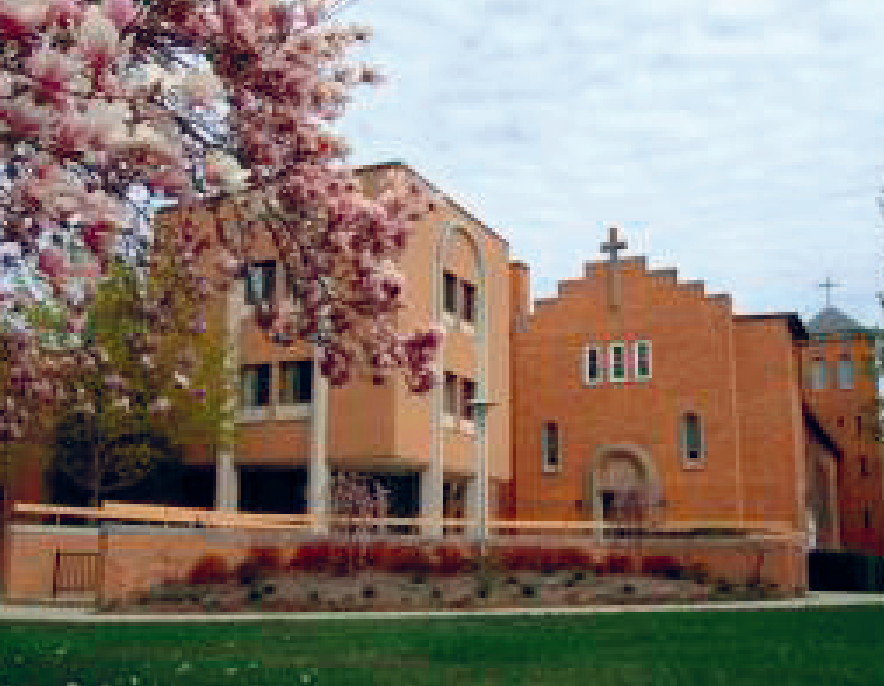
The motherhouse of the Sisters was rebuilt, and a Spiritual Renewal Center was started to respond to the spiritual needs of those who are searching for meaning and spiritu growth.