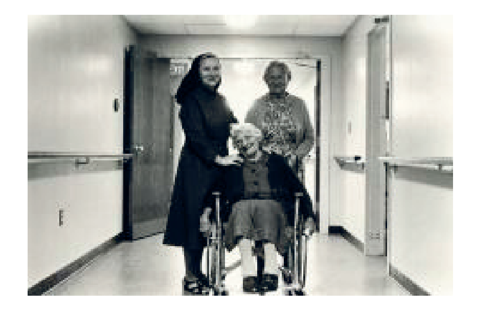
The addition of "B" wing was completed a Matulaitis Nursing Home to accommodat 30 extra beds for skille care in response to the increasing needs of the elderly and sick populations.