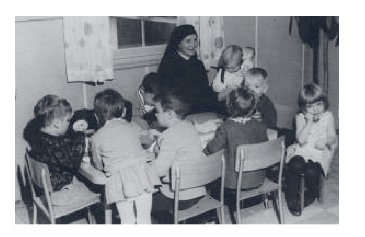
The Sisters started their mission in Montreal and Toronto by opening day care centers for preschoo' children and providing religious education in ' thuanian parishes.